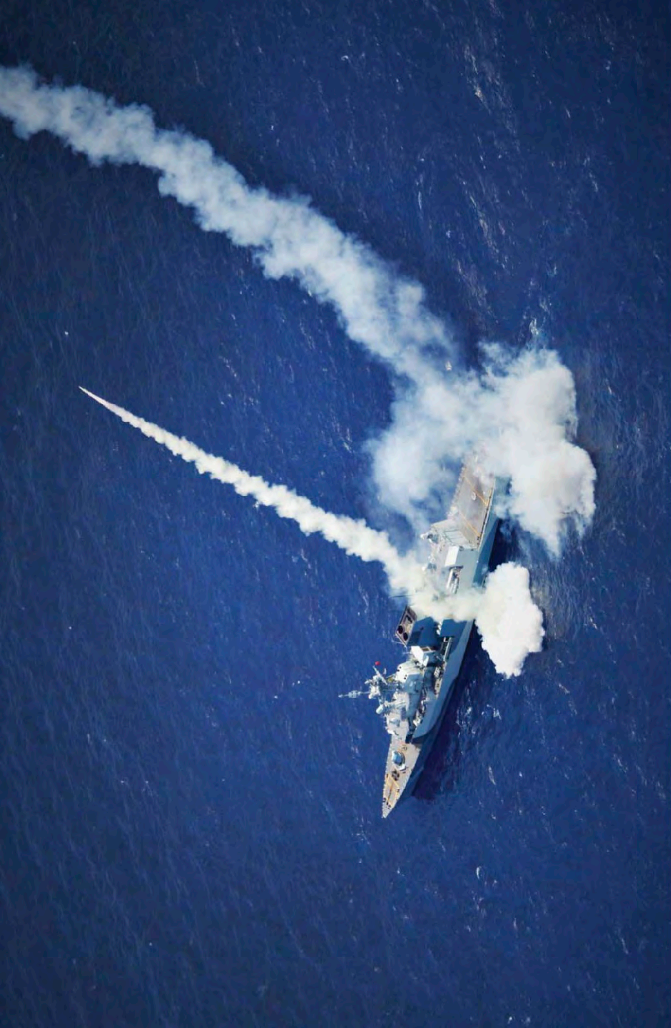
HMCS Regina , sporting a commemorative camouflage paint scheme, fires a rare salvo of two Harpoon anti-ship missiles against the decommissioned amphibious cargo ship ex-USS Durham (LKA 114) during RIMPAC 2020 off the Hawaiian coast.